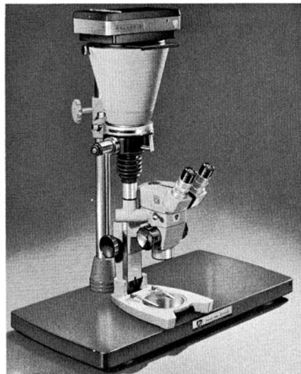
Ideal photographic application utilizes No. 682G Camera with Polaroid Land Camera back. This offers "picture in ten seconds" results.