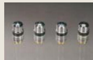
Plan Achromat Objectives

DUE TO CONTINUOUS DEVELOPMENT WE RESERVE THE RIGHT TO CHANGE SPECIFICATIONS WITHOUT NOTICE