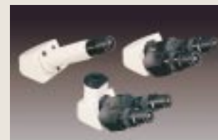
Range of Viewing Tubes

The Trinocular head of the Microscope is designed to permit quick change from normal viewing position to photographic position which permits maximum light availability to the camera tube. The equipment comprises of a suitable adapter, photo eyepiece, cable release, SLR camera body with right angle view finder. The camera pack has a built-in automatic exposure meter and selection guide to optimize the exposure according to film speed and level of illumination.