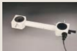
Dual Viewing Attachment