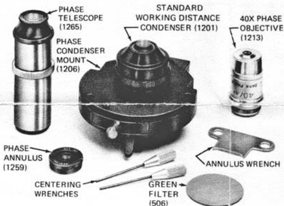
Figure 1. 1206 PPL Outfit

When adding phase equipment to A Ten or One-Twenty MICROSTAR this setup procedure should be followed. These instructions will also be of use when changes are made in condenser, annulus, or objectives, since the alignment procedure is the same. Refer to Figures 1 and 9 for part identification.