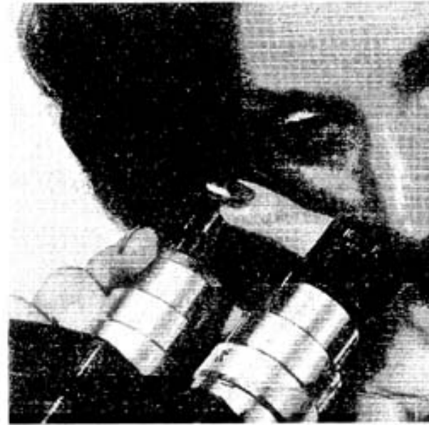
Figure 5. Focusing Telescope

The entire optical system is now aligned. Remove the phase telescope and install the eyepiece. The specimen may now be viewed under phase contrast.