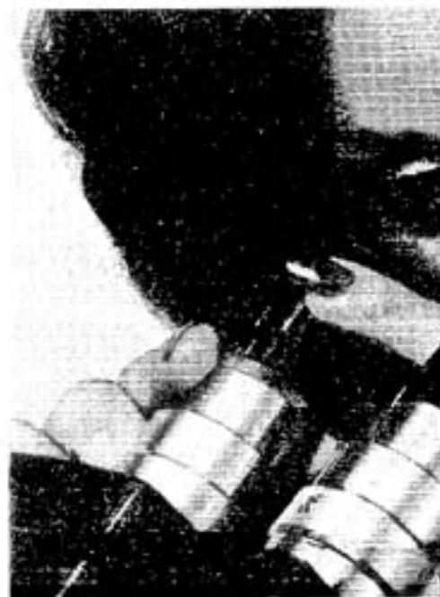
Figure 5. Focusing T

The entire optical system is now aligned. Remove the phase telescope and install the eyepiece. The specimen may now be viewed under phase contrast.